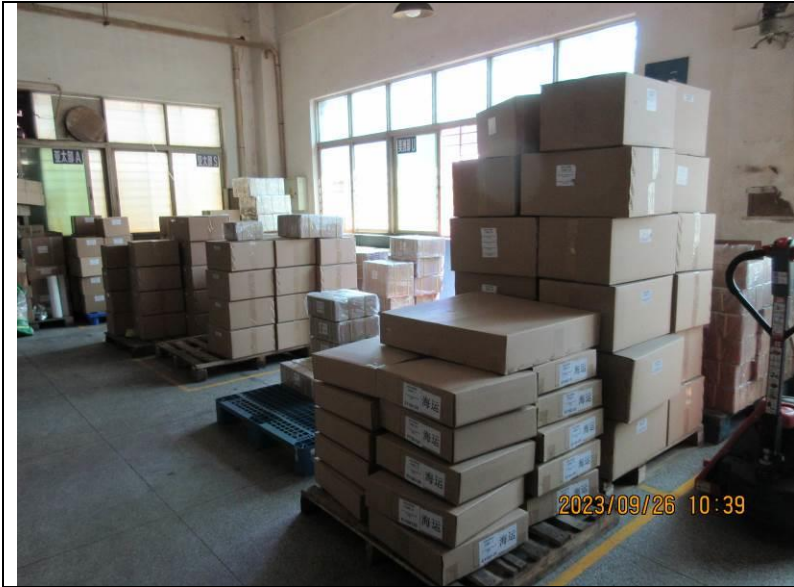
Finished Product Warehouse