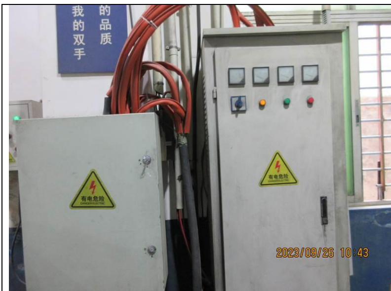
Warning Sign on Electrical Boxes