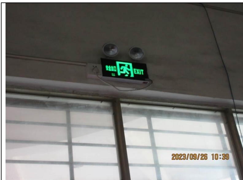
Emergency Sign and Emergency Light