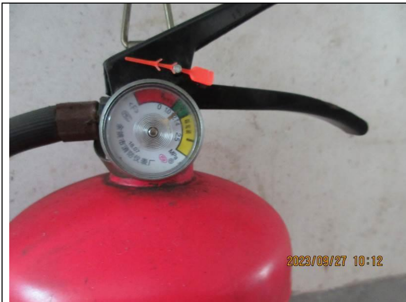
Proper Pressure of Fire Extinguisher