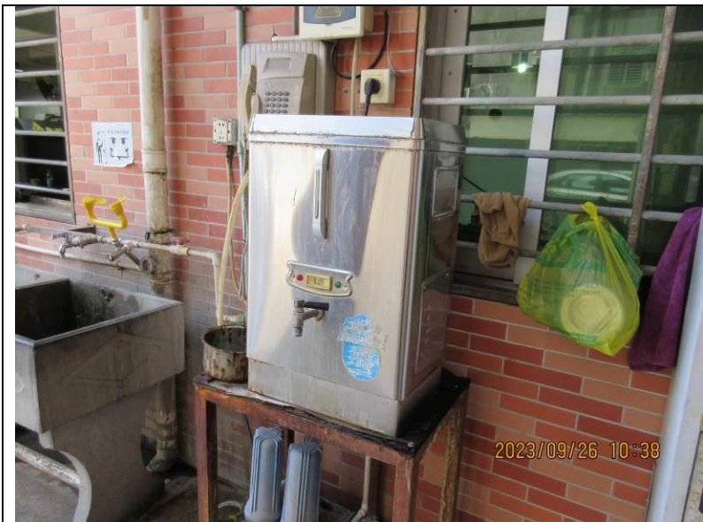
Drinking Water Facility