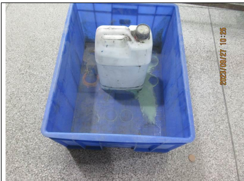
NC photo: the chemical (diluent) container was not labeled with safety labels.