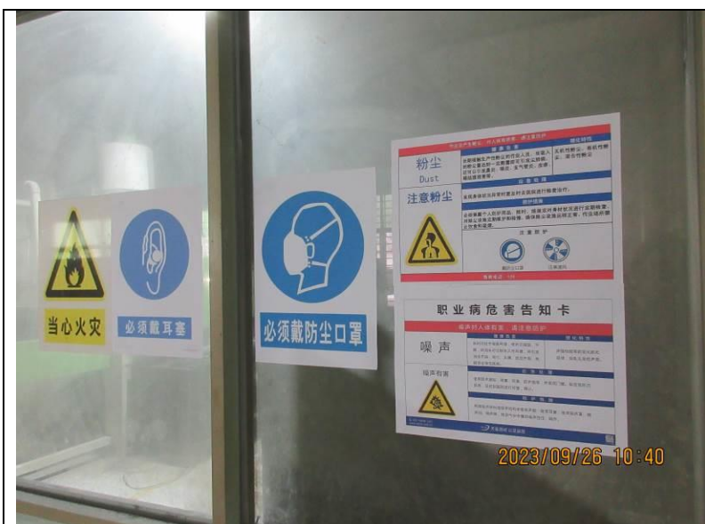
PPE Warning Sign