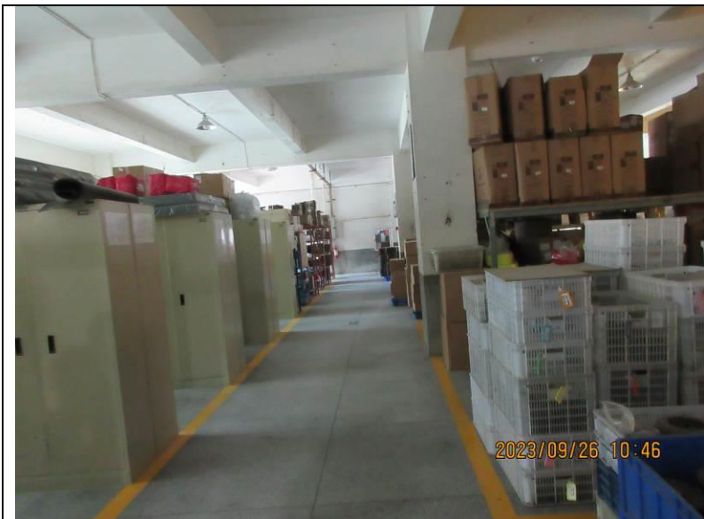
Raw Material Warehouse