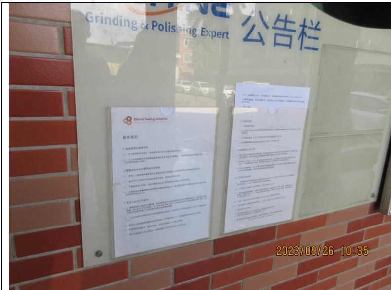
ETI Code Posted Onsite